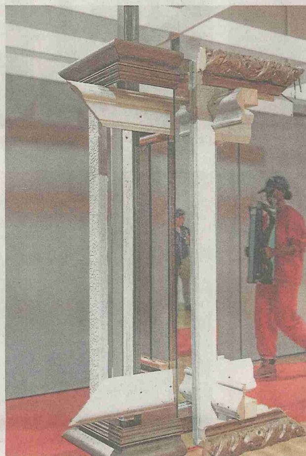
A detail of Rowe's architectural fragment assemblages, part of the pergola structures she created for the site-specific collaboration with Gilmore at DiverseWorks.