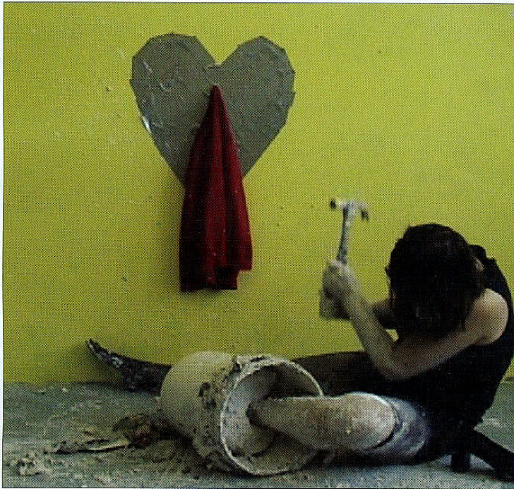
The artist encased her foot in concrete—and smashed her way out—for My Love Is An Anchor , 2004.

creation of a work in the studio. She records the performances alone or with a small crew and edits the footage minimally, cutting just enough to tease a narrative from the action while retaining a sense of real time.